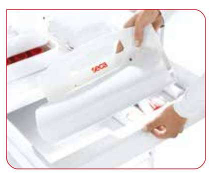
The measuring mat can be rolled up for space-saving storage.